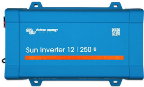
Sun Inverter 12/250