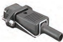
Retainer clip (included)