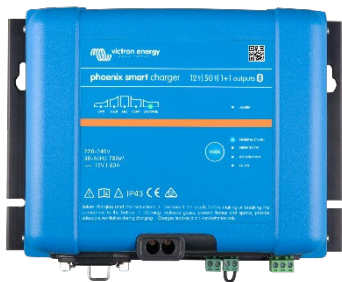
Smart IP43 Charger 12/50 (1+1)