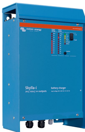
Skylla-i 24/100 (1+1)