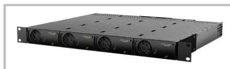
FLATPACK2 POWER RACK FOR HVDC (PN: 268035)