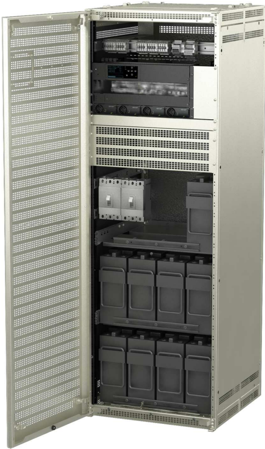
IBB SYSTEM IN FPC CABINET