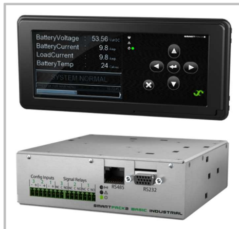
SMARTPACK2 MASTER AND BASIC INDUSTRIAL