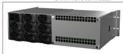
8 RECTIFIERS 3U SYSTEM - BULK OUTPUT