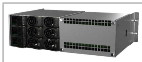
3 TIMES 2 RECTIFIERS SYSTEM IN A 3U RACK