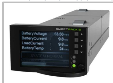
SMARTPACK S CONTROLLER